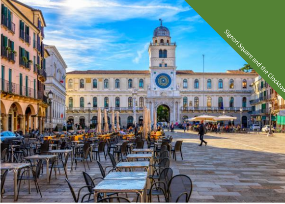
Signori Square and the Clocktower