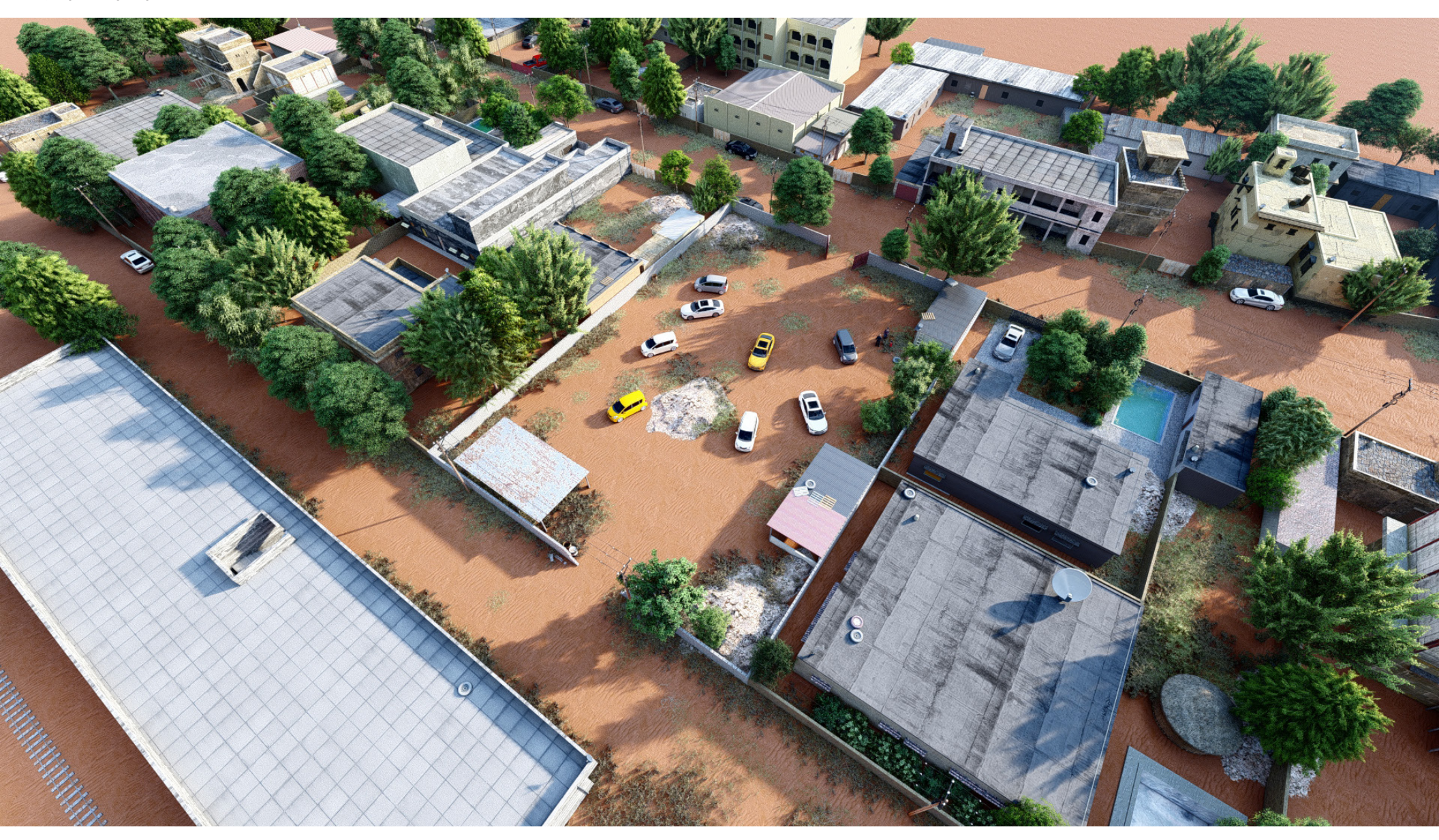
After registration is completed, participants will receive: a 3D view of the site (.skp) along with a topographic plan (.dwg), pictures, videos, material prices of the area, and further especifications of each room of the school. Register by clicking here.